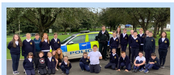
P6/7 Police Visit